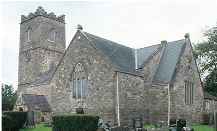
St. Michael's Church in Castlecaulfield, Donaghmore Parish